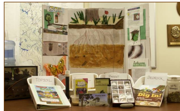
Soils Program Capsule

Our Mission: We will improve the local and downstream water quality for the future and reduce soil loss in our community by educating youth about the importance of natural resources. They will learn how to sustain a healthy environment that balances human, plant, and animal needs for habitat.