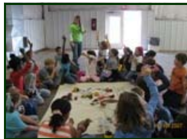
Osborn Park students teach the agricultural regions of Virginia