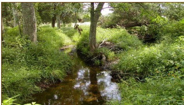
Buffer on a Horse Farm

Our Mission: To educate, motivate, and inspire agricultural landowners and other interested members of the community to recognize, value, and protect our natural resources.