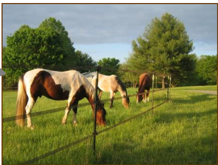
Healthy and happy horses enjoy grazing on a picturesque, small-acreage and environmentally-savvy horse farm in Gainesville, Va.

The health of the Chesapeake Bay depends upon cooperation by all land users-- including our horse farms.