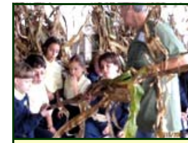
PW Farm Bureau Women's Committee member talks about crops