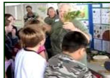
Tree Growth program presented by a Master Gardener