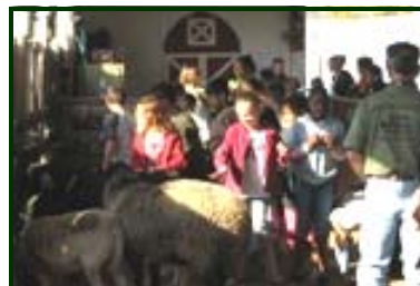
Children's Farm provided by PWC Animal Control