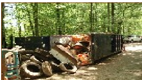
Veteran's Park Clean Up

The Prince William Soil and Water Conservation District locally promotes the Adopt-A-Stream program with support from the Virginia Department of Conservation and Recreation and PWC Watershed Mgmt. Branch. There are about 1,100 miles of streams in Prince William County. Currently we have 51.2 miles of stream which have been adopted from program inception-to-date.