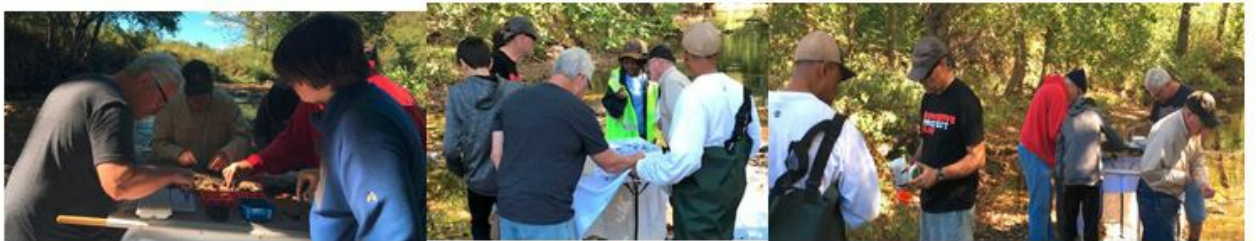
Broad Run Site