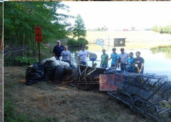
Prince William County Habitat for Humanity Volunteers