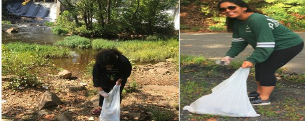
GMU Advocacy and Sustainability students - Water Health Educators at the Lake Jackson Dam area