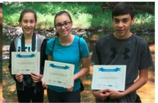
Prince William Forest Park Site