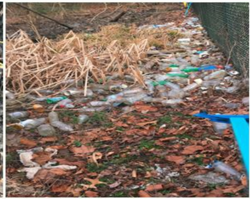
Promote a healthy County by promoting environmental friendly habits in the Communities