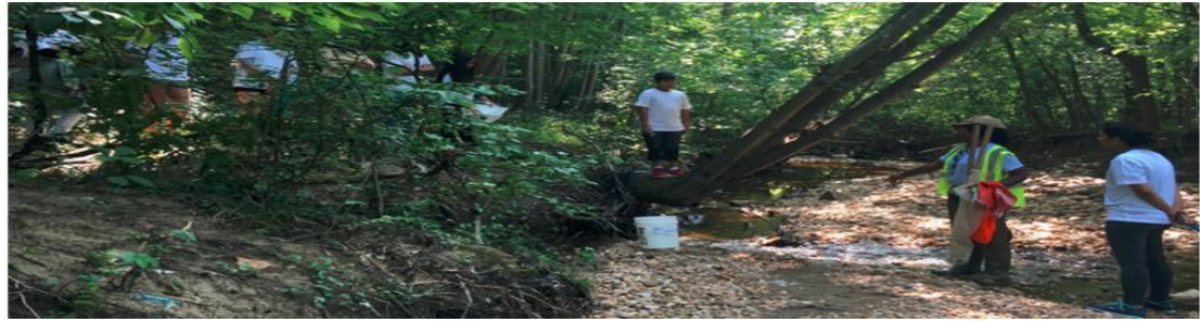
Water Quality Monitoring with students of the America Nepalese Society - Deweys Creek.