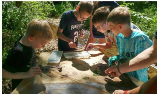
STEM Mentoring site- Andrew Leitch Park